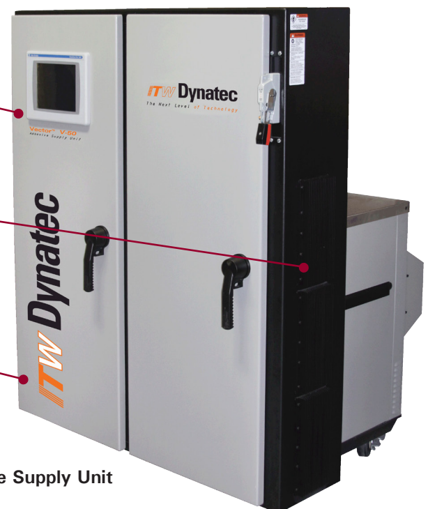
Vector™ V50 Adhesive Supply Unit

Reduction of multiple drives and gear pumps reduces capital investment and simplifies maintenance and spare parts inventory.